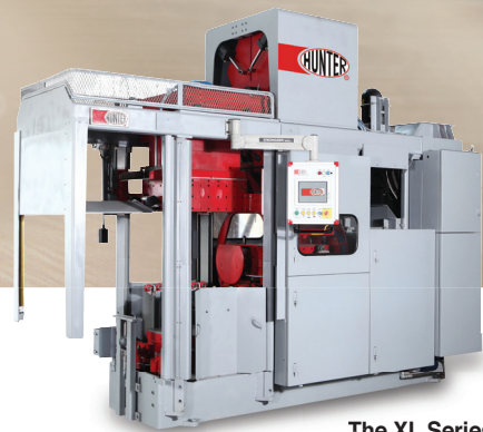
The XL Series

Hunter pioneered automatic matchplate molding nearly 50 years ago and has continued its commitment to innovation, since that time. This commitment has provided the world foundry market with better productivity in molding machinery and mold handling lines.